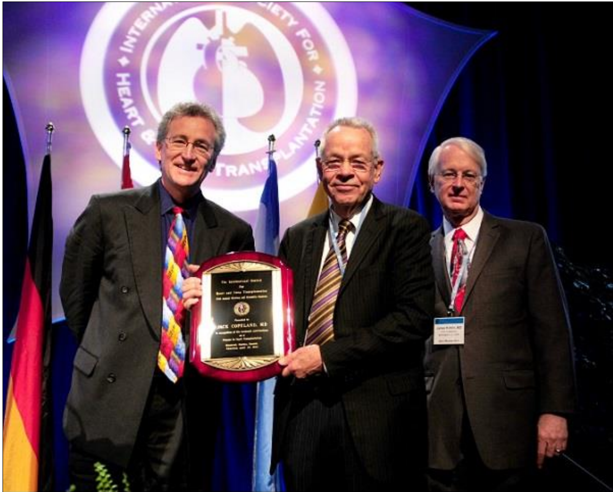
2013 ISHLT Pioneer in Transplantation: Jack Copeland, MD